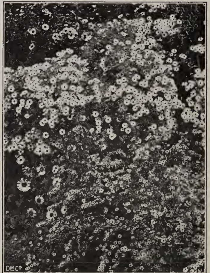
JAPANESE HARDY ASTER

No less than 5 at the 10 rate, 25 at the 100 rate. Minimum order $2.00